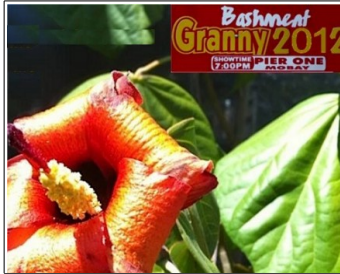
Bashment Granny 2012