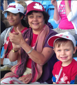
Canadian women's football @ Coventry